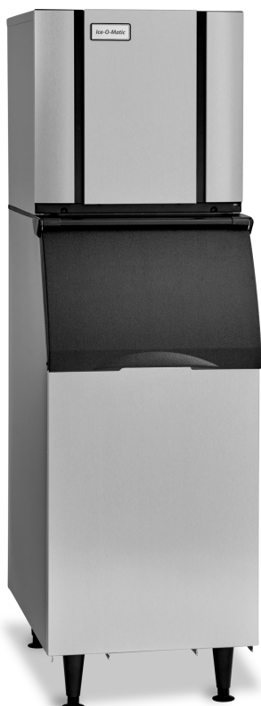
CIM1126 ON B42