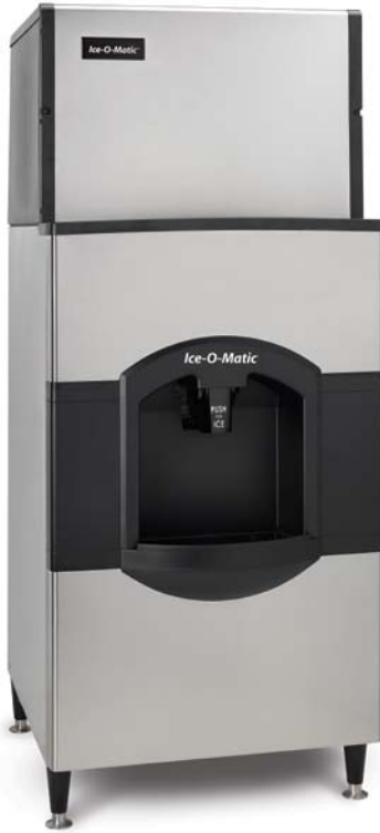
CD40030 WITH ICEO400