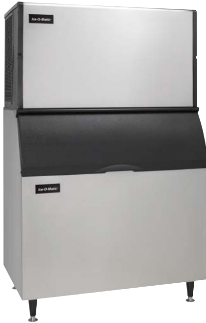
ICE1806 ON B100