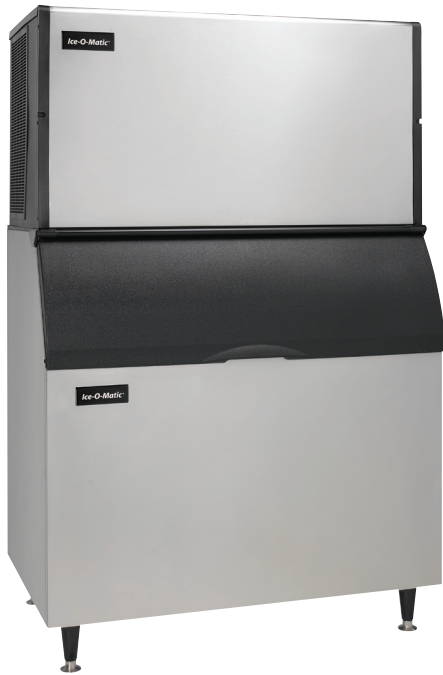
ICE2106 ON B100